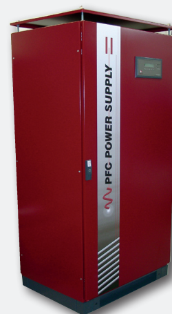
Fig.2 PFC rectifier type Wärtsilä JOVYREC GRP